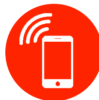
Compatible with ruggedised devices