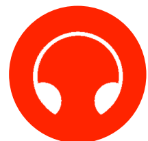
Wide range of compatible accessories